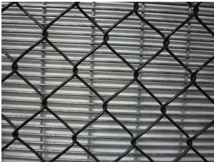
Example of security mesh installed on the inside of a storage cage.